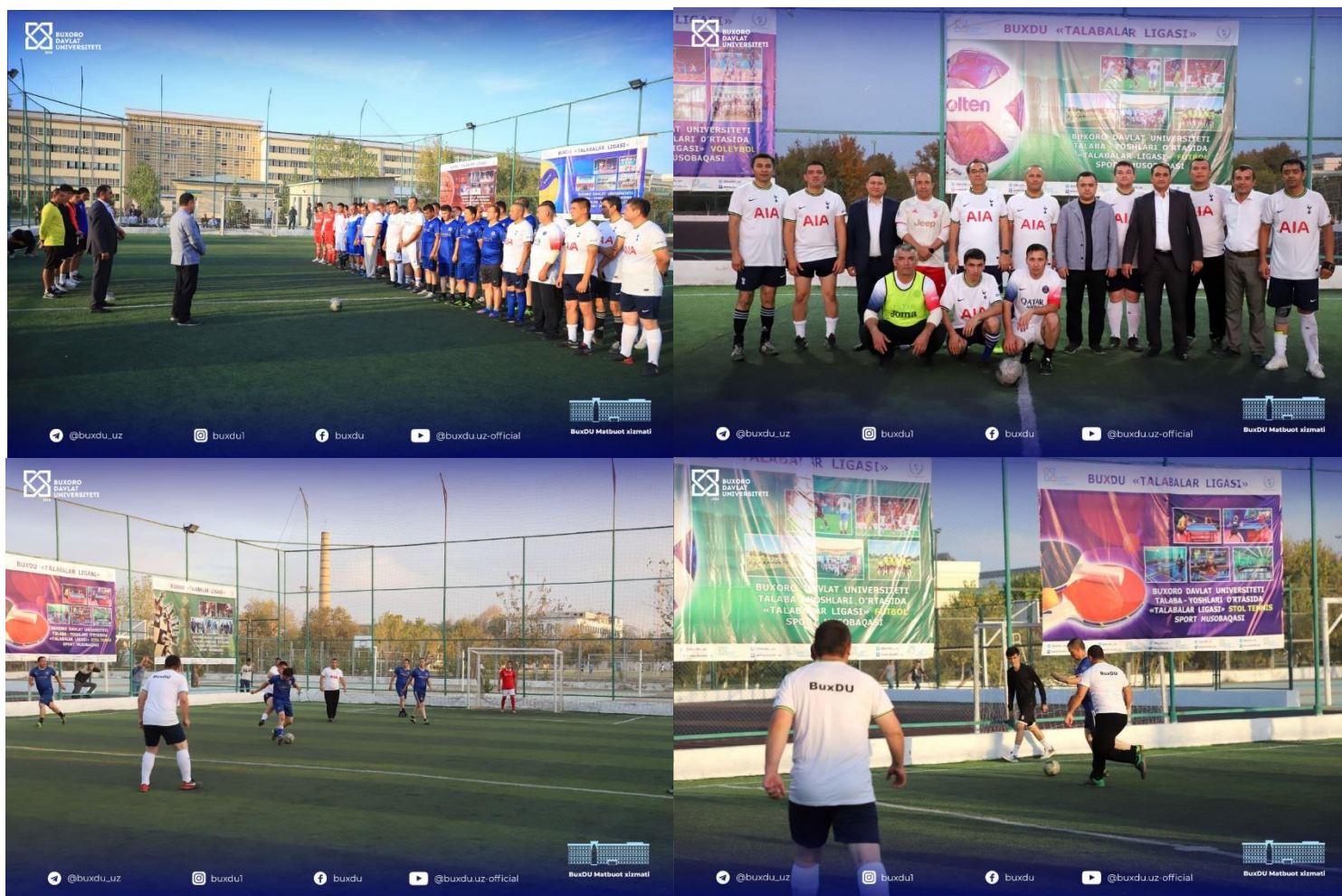
Bukhara State University wrestling between male and female students

On the second day of the regional stage of mass sports competitions among professors of higher educational institutions within the framework of the "Olympiad of Five Initiatives", competitions in two types of sports were held.